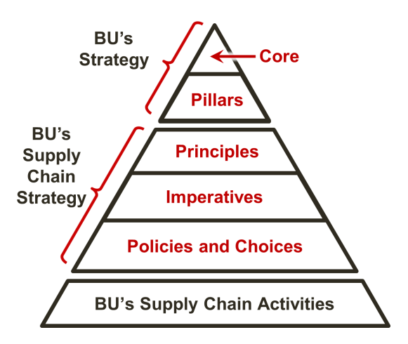
Figure 1: Levels of abstraction

A second dimension cuts across all the supply-chain relevant functions of the business, along what we call the thematic range . The overall task of a supply chain strategy along this dimension is to harmonize the efforts of all the supply-chain relevant functions towards the fulfillment of the business strategy.