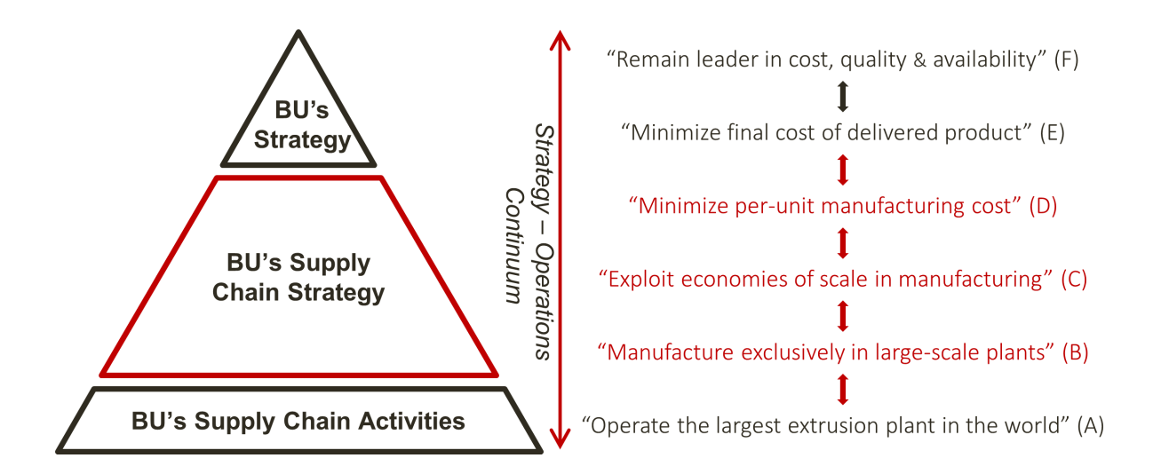
Figure 3: Ideas along the strategy-operations continuum

largest laminate extrusion plant in the world. Operating this huge plant is a distinctive supply chain advantage that can be logically connected with Lamynix's business strategy through the company's supply chain strategy. The logical connection, illustrated in Figure 3, goes as follows: Lamynix 'operates the largest extrusion plant in the world' (activity A), as an implementation of their policy of 'manufacturing exclusively in large-scale plants' (policy B); that policy seeks to 'exploit economies of scale in manufacturing' (imperative C), in order to 'minimize the per-unit manufacturing cost' (principle D); this, in turn, is done to help 'minimize the final cost of the delivered product' (pillar E). That pillar of Lamynix's business strategy was set to support its core strategy: to 'remain the leader in the laminates market', in terms of cost, quality and product availability (core F).