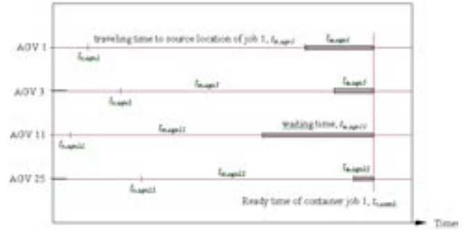
Figure 1: Chart gives the waiting of AGVs that are able to serve container job 1.

In Figure 1, we show all the AGVs that are able to reach the source location of container job 1 before 00:30. tr_{agvi} denotes the ready time of AGV i after it serves its last job. tr_{agvi} is the traveling time from location of AGV i to the source location of container job 1. tw_{agvi} is the waiting time that AGV i incurs if we deploy AGV i to container job 1. As shown in Figure 1, AGV 25 is able to serve container job 1 with the shortest waiting time. Hence AGV 25 is deployed to serve container job 1.